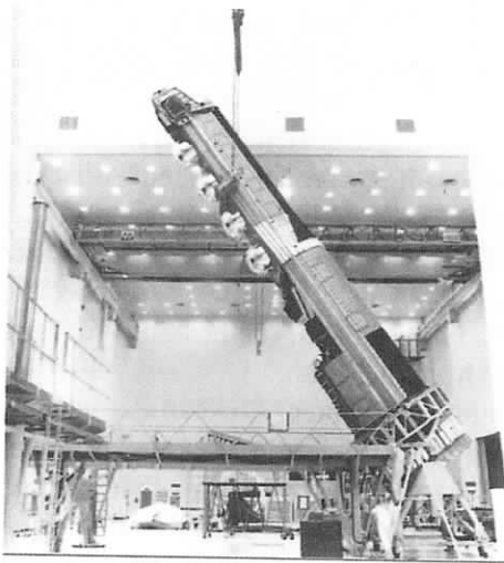
KH-9 HEXAGON Integration.

US intelligence users and mapping, charting, and geodesy (M&G) organizations with vast amounts of nearly simultaneous contiguous coverage.” HEXAGON imagery also provided “order-of-battle information across entire Soviet military districts...in a short time frame.” In addition, Sino-Soviet military tactics could be determined from imagery of military exercises. 28 Increasing the ability to collect imagery of other areas of the world – whether the Middle East or South Africa – was a further benefit.